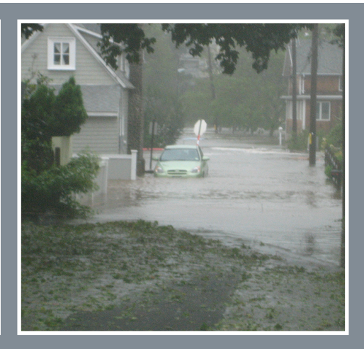
Stormwater flooding and damage on Branford roadways.

sea-level rise. In addition to the traditional ways the town funds projects, such as capital improvement planning, federal and state grants, municipal bond issuance, and "pay-as-you go"; a coastal resiliency reserve fund would be another tool in the tool-kit to help Branford manage the costs of adapting to climate change over the long term. It's a simple idea that draws on the town's experience of managing other future financial expenses such as employee pensions, OPEB trusts, and self-insurance.