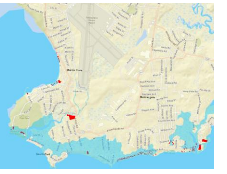
Figure: Current situation, no flood control structure. Figure: Flood control structure across Morris Creek, Farm River, and along Morris Cove.