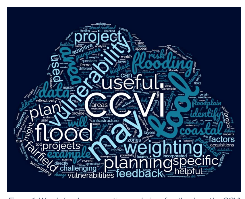
Figure 1: Word cloud representing workshop feedback on the CCVI

Similar to CCVI feedback, the ZSR comments covered the same four topics. The comments and feedback aided in the identification or refinement of some ZSR, but also helped in clarifying how the ZSR is a useful tool, and how stakeholders could use and benefit from the tool in the future. Figure 2 identifies some of the key words noted in feedback.