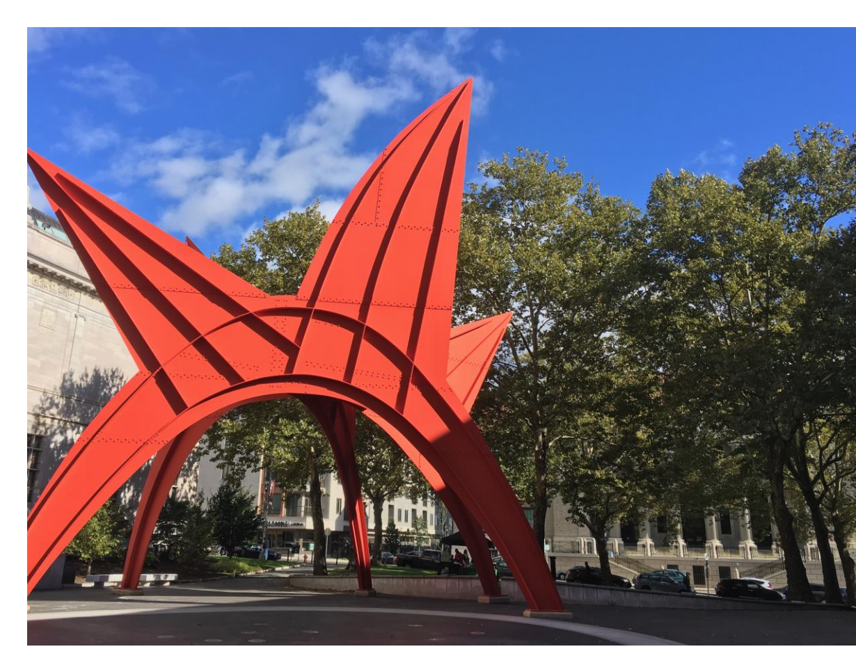
Urban trees can reduce surface level heat 5-10º F and are importan components in making "third place" public spaces feel safe and welcoming

A low impact design way to alleviate heat from roof is to cover the roof with low maintenance drought resistant vegetation. Green roofs can reflect heat, insulate the building and absorb precipitation and stormwater. Cost of green roofs can vary and may be prohibitive for residential structures. However, several municipalities in Connecticut have used inclusion of a green roof as a development bonus to incentivize green infrastructure on new construction or extensive renovation. Stanford, New Haven and Hartford have used green roofs as a development bonus in their zoning codes.