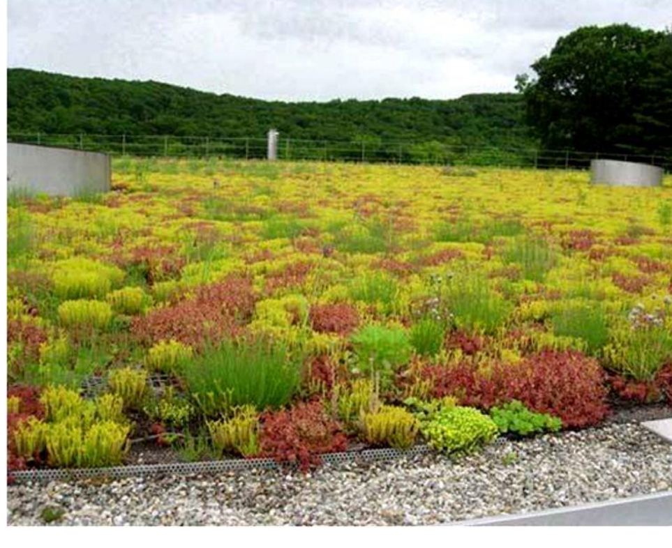
The green roof covering the Whitney Water Treatment Plant in New Haven is the largest in the state at 30,000 sq. ft.

Zoning codes can address heating through regulations on reflective surfaces. Large impervious surfaces like rooftops or parking area can retain heat raising the base temperature in the local area. Reflective surfaces however absorb much less heat leading to cooler surface temperatures compared to darker or nonreflective surfaces. New Haven CT adopted zoning regulations requiring any new site or expanded site with a half acre or more of impervious surface area (not including roofs) to be at least 50% shaded or be constructed of a reflective material.